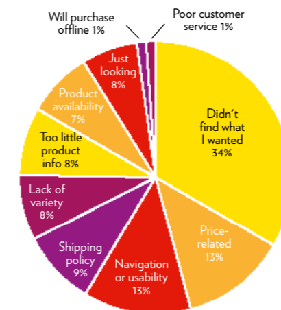
Barriers to buying on e-commerce sites according to internet users worldwide, April-June 2009 (% of respondents)