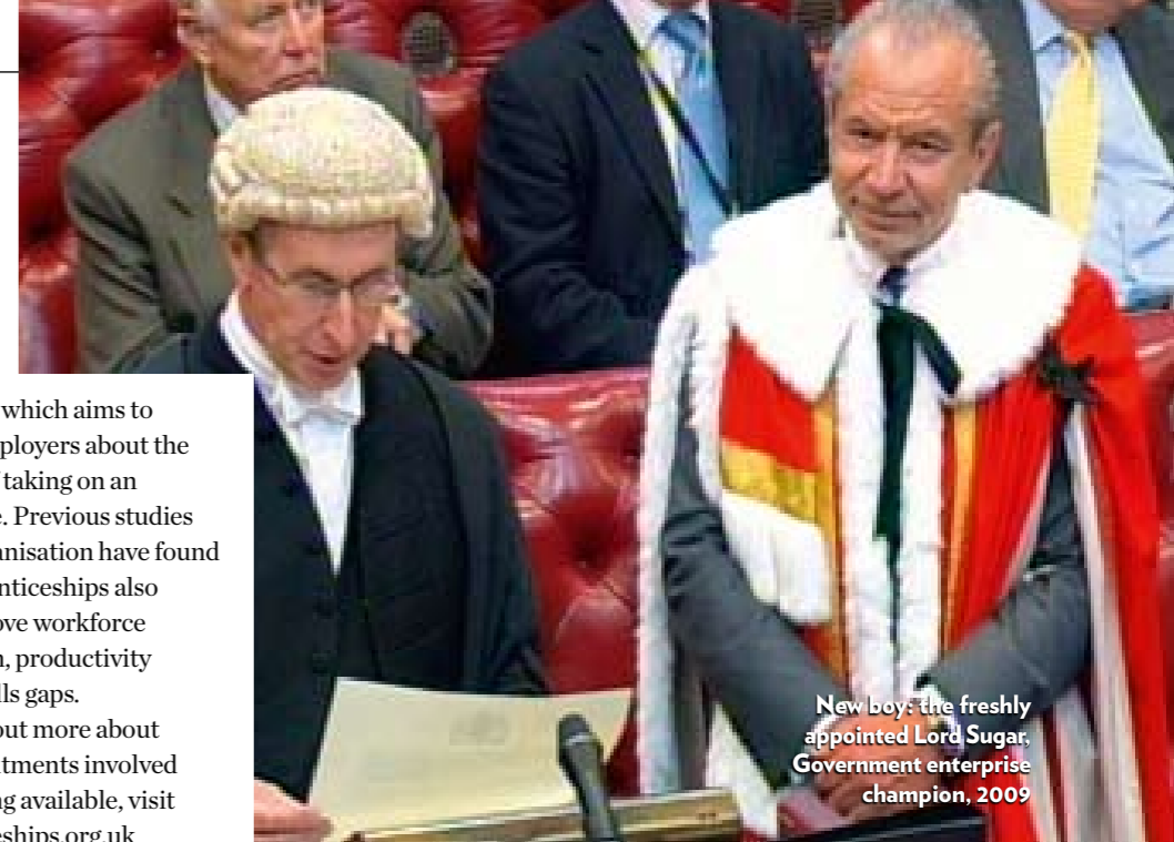
New boy: the freshly appointed Lord Sugar, Government enterprise champion, 2009

To find out more about the commitments involved and funding available, visit apprenticeships.org.uk